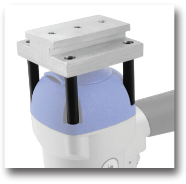
Connecting Plate H Style