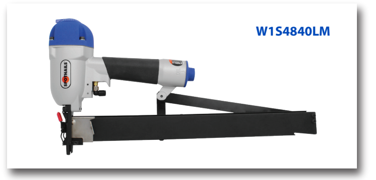
18GA Narrow Crown Stapler- 300 Magazine Capacity