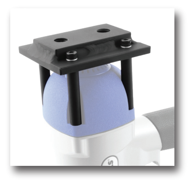
Connecting Plate T Style

Most of our tools can be fitted into production processes using the connecting plates. A machine with a mounted bracket can use these connecting plates to install our tools.