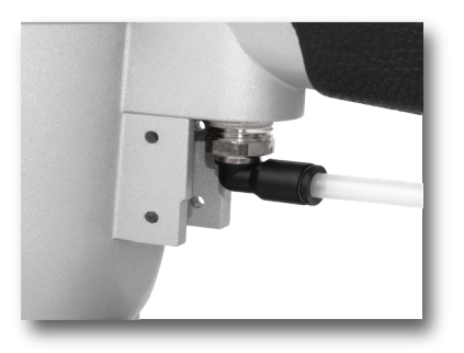
Normally ON with Air Pilot

Three different options in our remote actuation valves that are quick replacements in existing system.