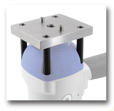
Connecting Plate with Pin Locators