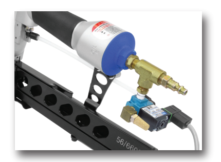
Normally OFF with Electric Solenoid (24 VDC or 120VAC)