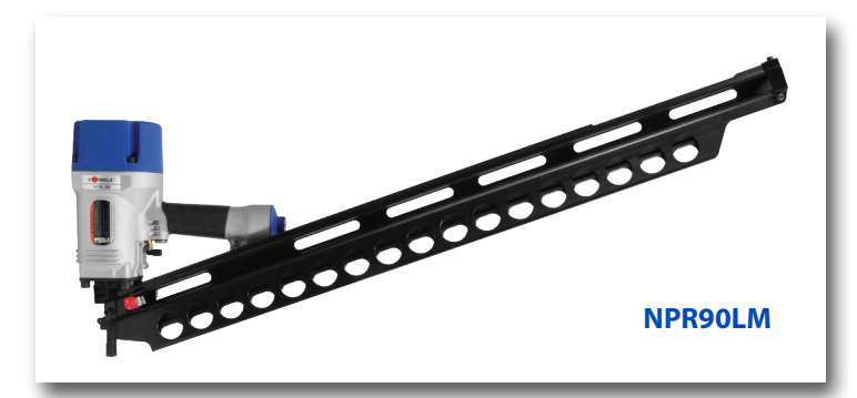
21° Framing Nailer- 162 Magazine Capacity