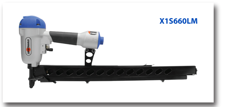
16GA Medium Crown Stapler- 337 Magazine Capacity

Division of Peace Industries, LTD 1100 Hicks Road Rolling Meadows, Illinois 60008 847-259-1620 www.spotnails.com