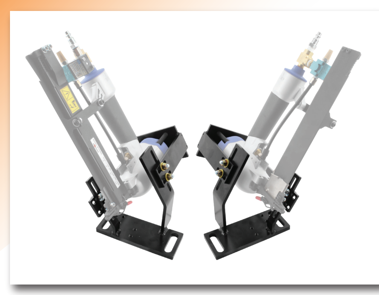
Angle Mounting System for X1 Body Style Tools (Left and Right)