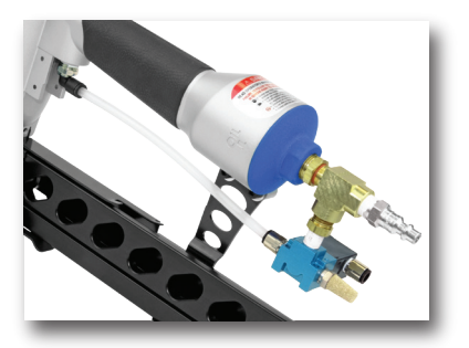
Normally OFF with Air Pilot